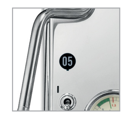
Cronometro machines are equipped with shot timer as standard.

The Giotto and Mozzafiato Cronometro V machines introduce users to the Rocket Espresso movement for better espresso in the home without compromise.